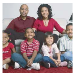
Sharing the Promise of Mental Health